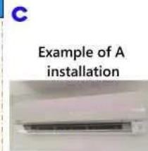
Example of A installation

Water must run downhill to external drain point. We do not use pumps to fight gravity. Gravity will win eventually and you'll have a wet ceiling / floor or both.